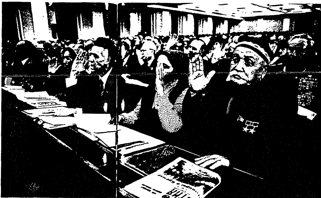
Members of the Crystal Club, seen here as they rubber stamp elections with their usual affirmative votes.

People are encouraged to make suggestions for topics for discussion for the following month's meeting. You can either bring it up during the meeting, or write it down or mention it to an officer before or after the meeting. Ideas can be for speakers, or for subjects to discuss informally. It's fine to ask things, such as where to buy shoes, or how to cover 5 o'clock shadow, or the old nature vs. nurture argument, or whatever, too. Many of us have lots of good ideas.