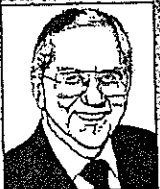
ED McMAHON of NBC's Tonight Show

CRYSTAL CLUB BUS HAS JUST BECOME THE THIRD TEN MILLION DOLLAR WINNER!